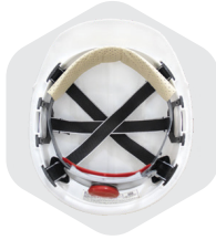
8 point Nylon suspension