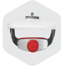
"Turn-n-Lock" Wheel Ratchet